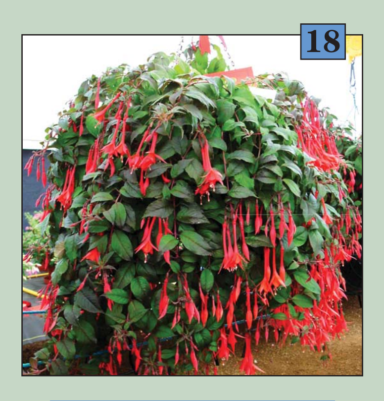
18 Fuscia Hanging Basket This beautiful plant with its red blooms is a stunning attraction to any shade garden.