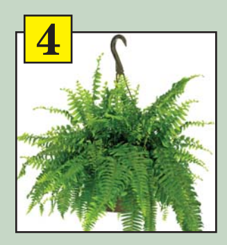
4 Boston Fern

Ivy geraniums make an excellent choice for containers. These plants enjoy full sun.