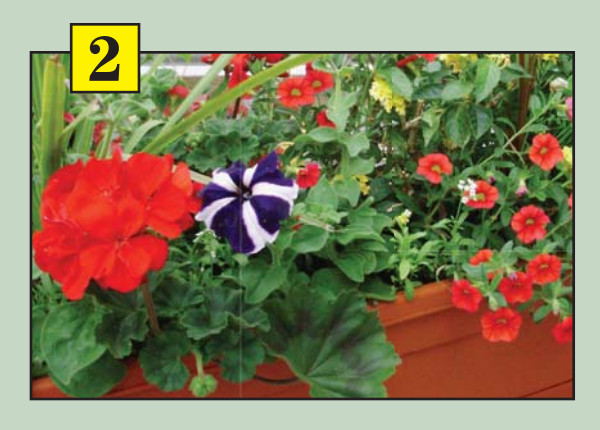
2 Window Box Planter

These petunias bloom like crazy all summer long. We're nuts about these petunias and we think you will be too!