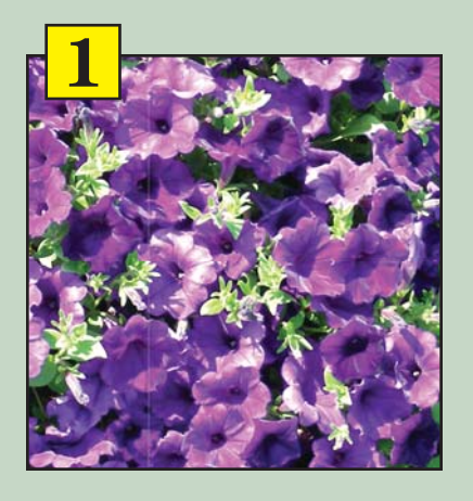
1 Petunia Container

These petunias bloom like crazy all summer long. We're nuts about these petunias and we think you will be too!