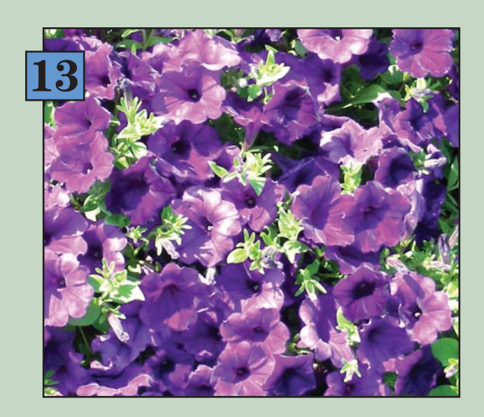
13 Petunia Purple Wave Hanging Basket For long lasting colors, these guys are the way to go. Petunias prefer full sun and well-drained soil.