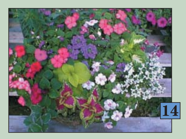
14 European Shade Mix Container A wonderful mixture of Impatiens, Coleus, Forget-Me-Nots, and Baby's Breath to help add a splash of color to any shady area.

Collections of different one and one half year old plants. Perennials continue to add beauty to your yard because they come back year after year. Many of these plants make great cut flowers, attract hummingbirds, can be dried, become larger each year and are easy to grow.