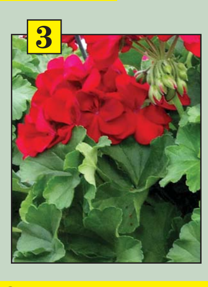
3 Ivy Geranium Container

This lovely window box is a sure hit with gardeners. It contains Geraniums, Petunias and Impatiens.